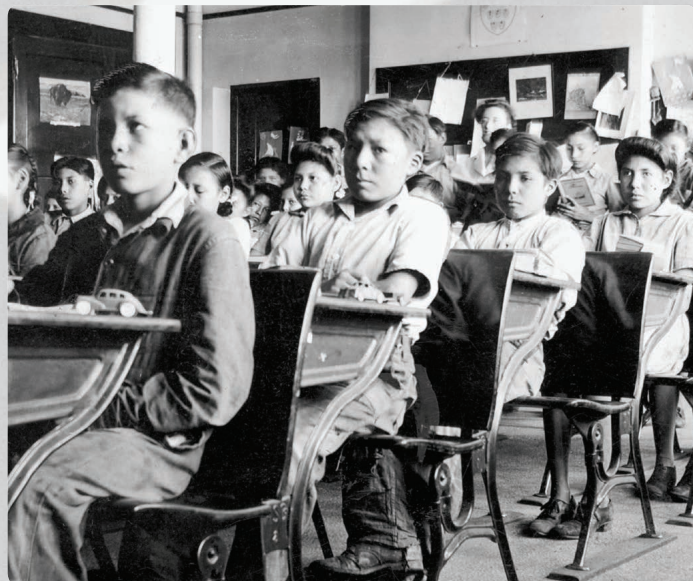
Residential School Classroom.